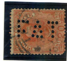
Early Perforated Initials (Perfin) Italy circa 1895