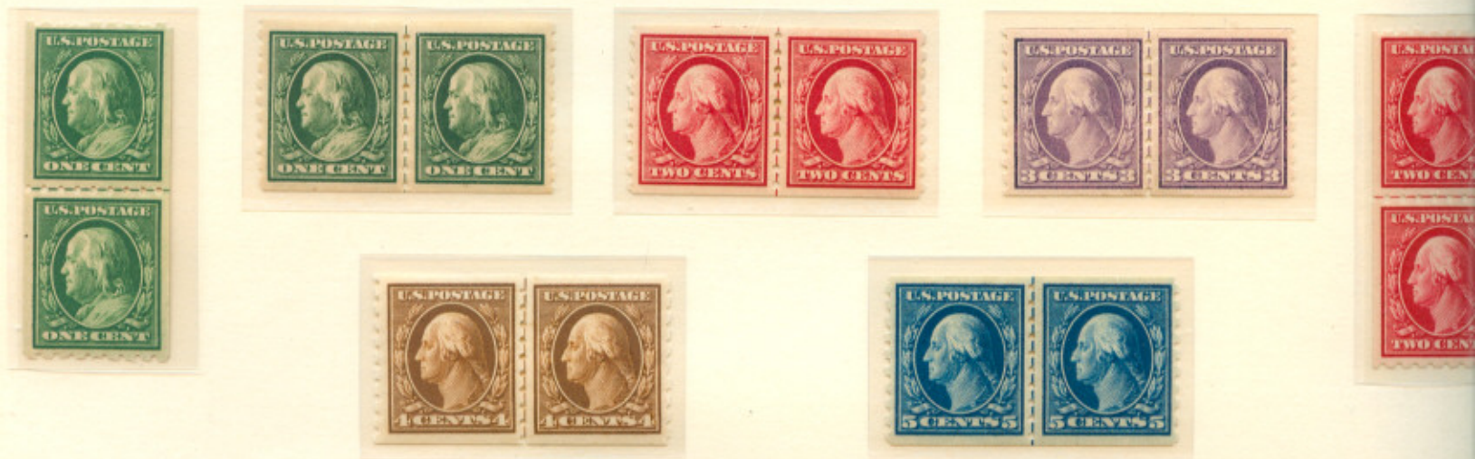
The 1910 perf-8.5 coils consisted of five values.