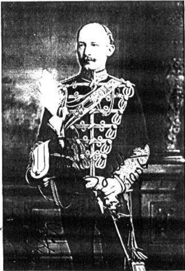
1879 L. H. A. CO. MAJ.-GENERAL BADEN-POWELL L. H. A. CO.