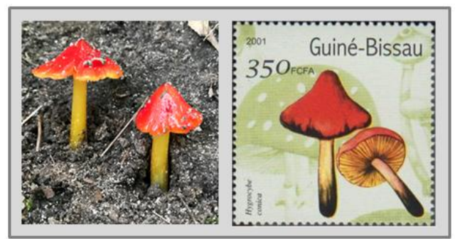
Image that, finding witch's hats ( Hygrocybe conica ) in a cemetery (left)! They have been honored on a few stamps including this 2001 issue from Guine-Bissau.