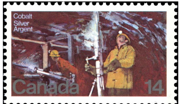
Cobalt, Ontario was the largest silver producer in the world during the first decade of the 20<sup>th</sup> century.