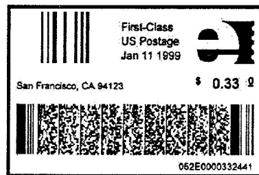
The indicium's bar code contains a digital signature and information such as the postage rate and date.

© 1999 Windows Magazine May 1999, Page 27.