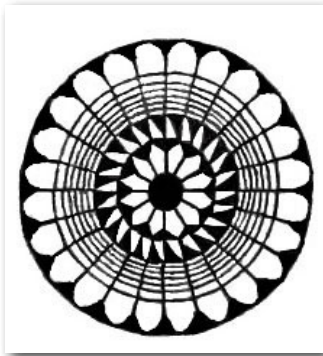
◀ Figure 1. The Wheel of Fortune canceller, often found duplexed with a town datestamp.

In 1880, the F.P. Hammond Co. of Aurora, Illinois, introduced the cancel/killer shown enlarged in Figure 1. Today this fancy rubber cancel is called the Wheel of Fortune cancel. The highly detailed stamper was made possible with the inven-