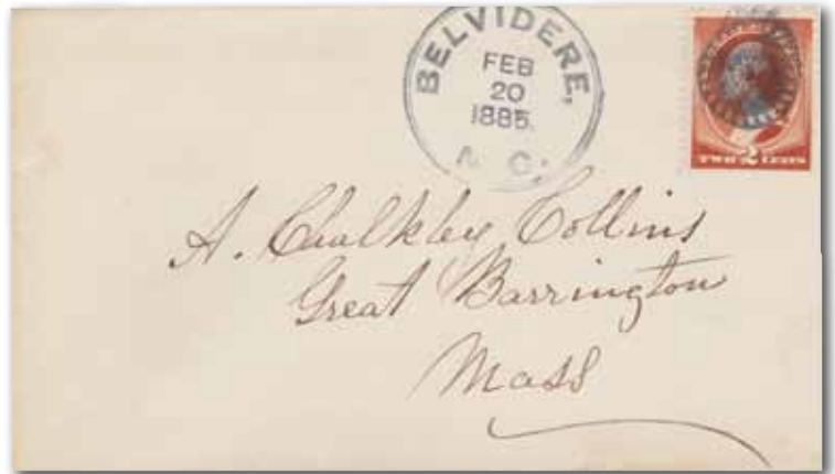
▲ Figures 4. February 20, 1885, the earliest use of the Wheel of Fortune canceller in North Carolina on a cover from Belvidere (Perquimans County) to Great Barrington, Massachusetts.