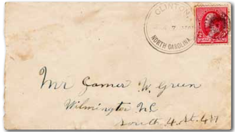
Figure 7. ▶ March 7, 1891, envelope posted at Clinton (Sampson County) to Wilmington (New Hanover County) with town datestamp and Wheel of Fortune killer.