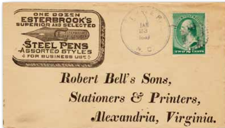
◀ Figures 10. January 23, 1889, envelope from Tyner (Chowan County) to Alexandria, Virginia on a handsome advertisement cover with town datestamp and Wheel of Fortune killer.