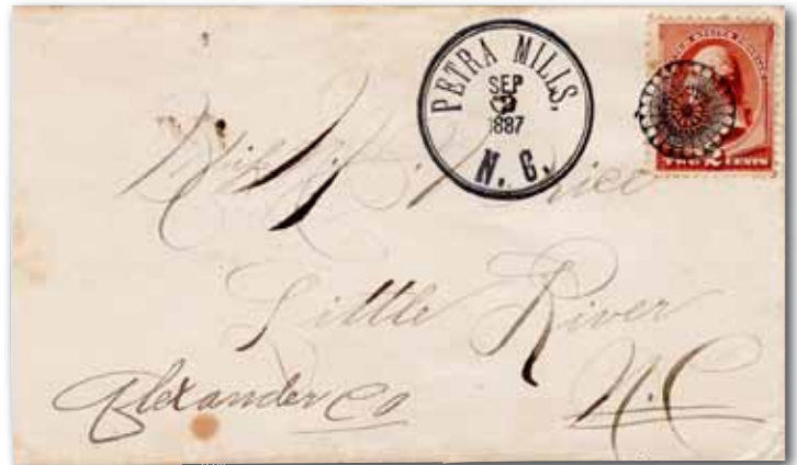
Figure 9. ▶ September 2, 1887, envelope posted at Petra Mills (Caldwell County) to Little River (Alexander County) with a beautiful example of the town datestamp and Wheel of Fortune killer.