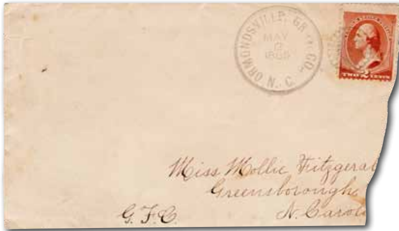
◀ Figures 8. May 12, 1885, envelope from Ormondville (Greene County) to Greensborough (Guilford County) with the "A" style town datestamp and the Wheel of Fortune killer. Note the datestamp includes the County name.