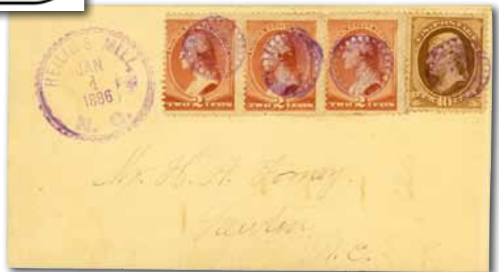
◀ Figures 5. Wheel of Fortune cancels/killers were generally used in conjunction with town postmarks as a duplex canceller. Shown here are a number of different types of town postmarks that used these killers, labeled Types 1 through 6. A stand-alone use of the killer is shown as Type 0.