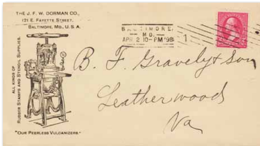
▲ Figure 2. April 2, 1898, illustrated advertising cover of the J.F.W. Dorman Company in Baltimore for the “Peerless Vulcanizer” which made rubber handstamp devices, like the Wheel of Fortune killer, possible.

In the November 2005 U.S. Cancellation Club News issue, Arthur Beane announced a project to produce a monograph on