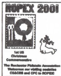
First US Christmas Stamp