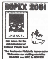
First NAACP Christmas Seal