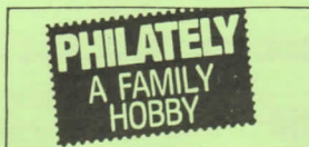
EXHIBIT voted upon by the attending ROPEX public.....

L. R. Moriarty Award - awarded to the MOST POPULAR