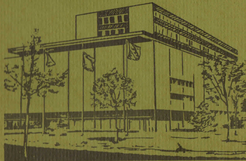
UPU Headquarters at Berne