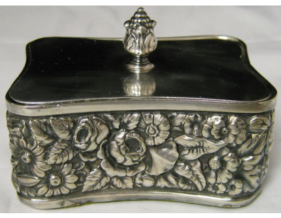
May 16-18, Rochester, NY