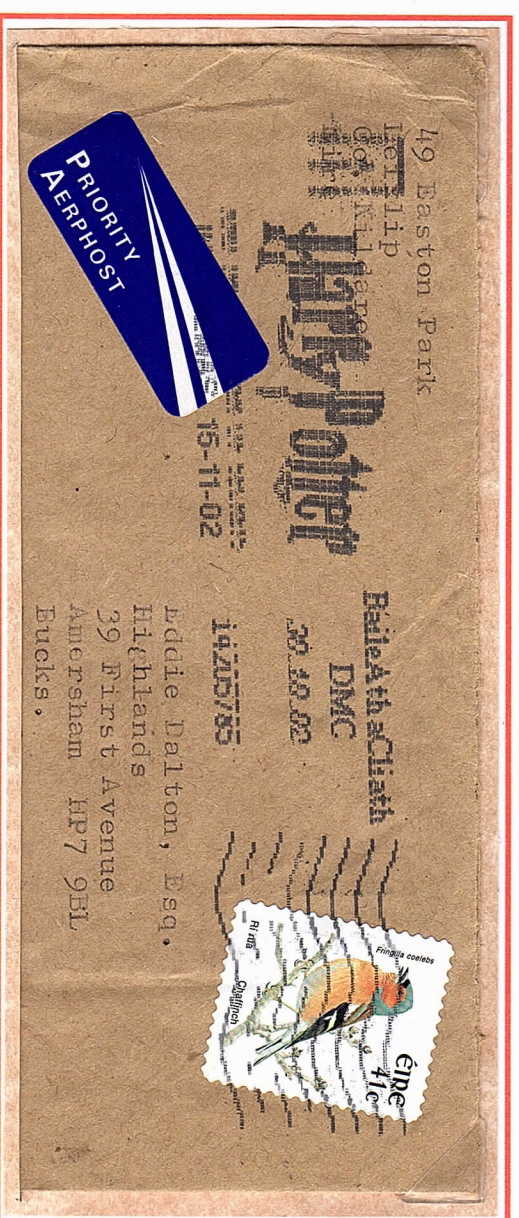
An Post (Irish Postal Service) also used a similar spray cancellation system. This cancel advertised the release of the second movie, Harry Potter and the Chamber of Secrets.

78 pence Airmail/Zone 1 Overseas to U.S. Letter to 20g. Apr 2, 2007 to Apr 6, 2008