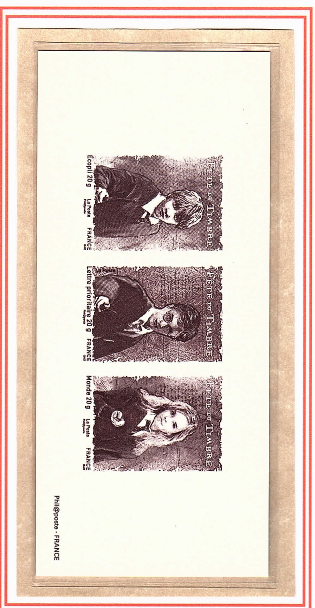
Single color proof of French issue

This exhibit examines the modern world of young wizards and witches created by J.K. Rowling as described in the original seven books and eight movies. It does not include information available exclusively in the three e-books, in the “Harry Potter and the Cursed Child” play or in the “Fantastic Beasts and Where to Find Them” movie.