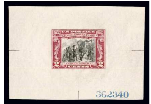
UNIQUE “SOUTHGATE” DIE PROOF