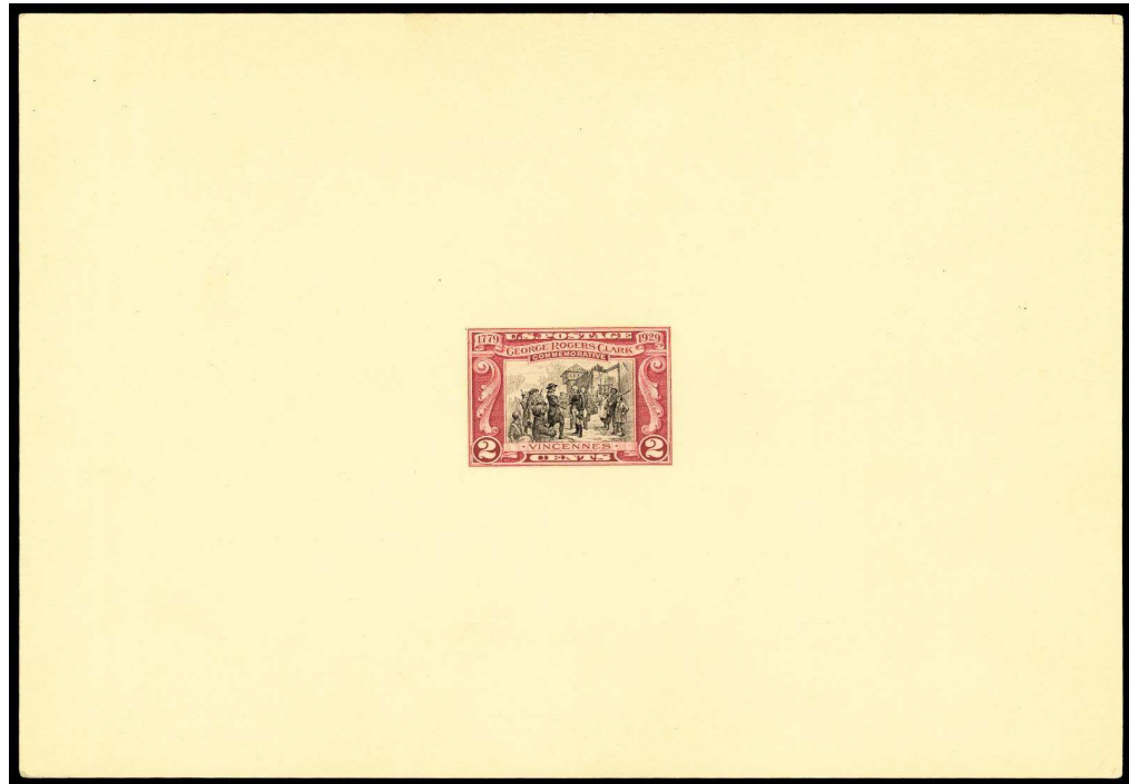
UNIQUE LARGE POSTHUMOUS HYBRID DIE PROOF CREATED FOR PRESIDENT FRANKLIN D. ROOSEVELT. (EX-FDR, EX-BIZÉ)

Witnesses have said that this line was caused by a piece of a cleaning rag caught in the machine, and as the volume of covers being mailed was so high, there was no time to take the machine apart to fix it. ■