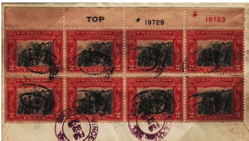
EARLIEST DOCUMENTED USE OF THE CLARK COMMEMORATIVE (FEB 23, 1929)

The second special die proof is the unique Posthumous Hybrid large die proof. Created for President Franklin