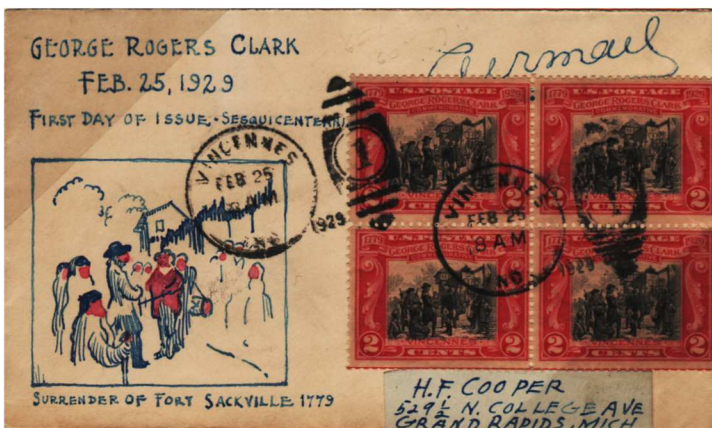
UNIQUE FIRST CACHET BY HOWARD COOPER. TWO OF THE THREE COOPER ONE-OF-A-KIND DESIGNS ARE IN THE EXHIBIT.

Continuing the exhibit in the Foreign Destinations chapter are examples of FDCs sent to Egypt, Switzerland, Germany and