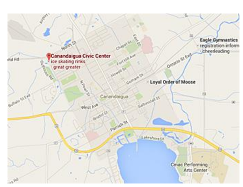
ROPEX 2015: May 15-17 at the Greater Canandaigua Civic Center, 250 North Bloomfield Rd, Canandaigua, NY Welcoming the national convention of the Auxiliary Markings Club

ROPEX and the DEALER agree to the following: