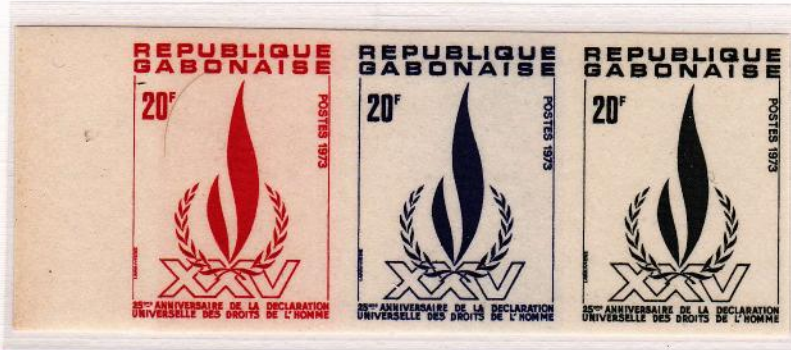
● Trial color plate proofs in 3 colors, red, dark blue and dark green