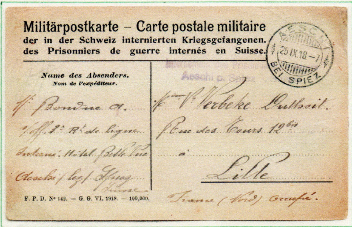
Special Swiss military postcard with imprint in German and French ", sent by French internee to Lille, France. from CAMP AESCHI bei Spiez, canceled Aeschi bei Spiez 25.IX.18. -7, and purple rubber stamp " Internement des Prisonniers de Guerre, Aeschi p. Spiez - Suisse

WORLD WAR I. 1914 - 1918. Again many foreign prisoners of war escaped to Switzerland and were interned in special internment camps. Their mail too was " postage free "