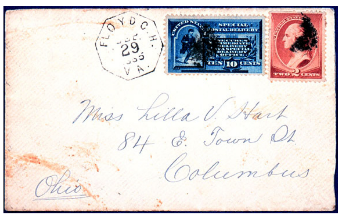
First Day of Issue (one day before service began) with script tracking number '1'