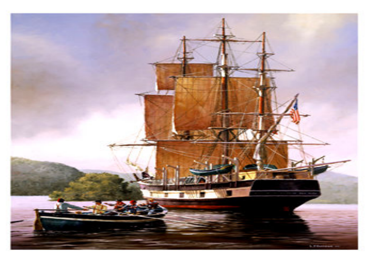
Whaleship Huron becalmed by Hudson 1836

Hudson, New York, named to commemorate Henry Hudson's first landing on the shores of the upper river, originated from the vision of an Association of New England Whalers, and became incorporated by an act of the New York State Assembly on April 22, 1785. By 1786, with a population of about 1500, Hudson had several wharves, four large warehouses, shops, barns and a distillery. The presence of twenty-five sea-going vessels made Hudson a major port.