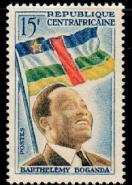
Central African Republic