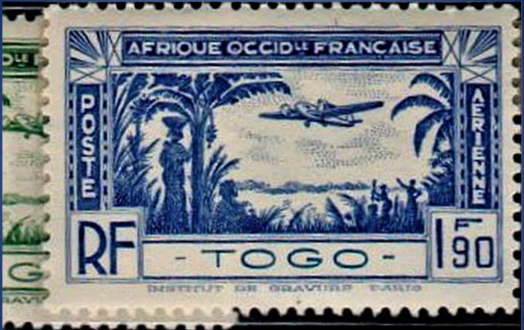
French Common Design for Air Mail in Africa