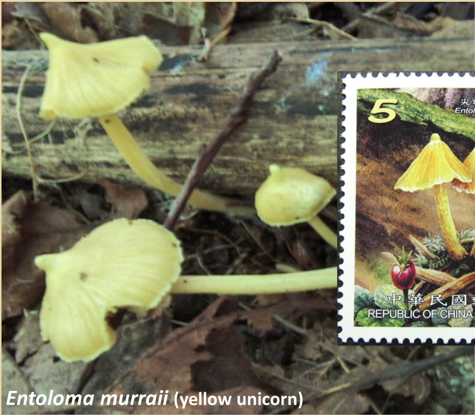
Entoloma murraili (yellow unicorn)