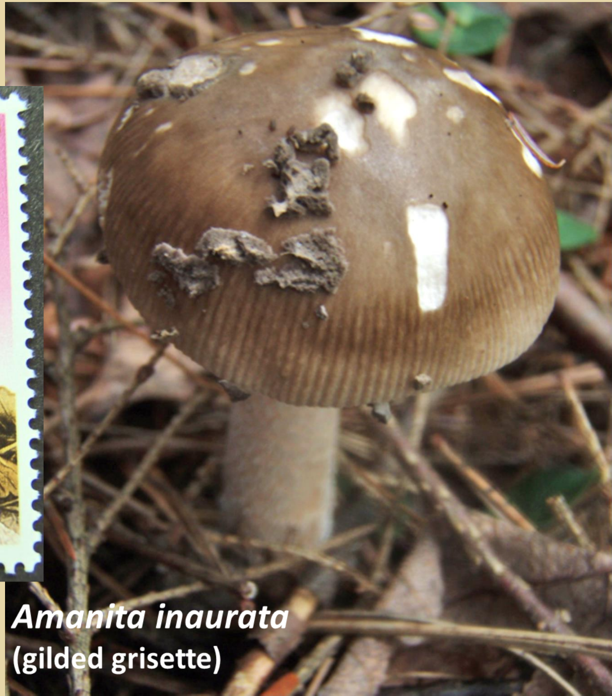
Amanita inaurata (gilded grisette)