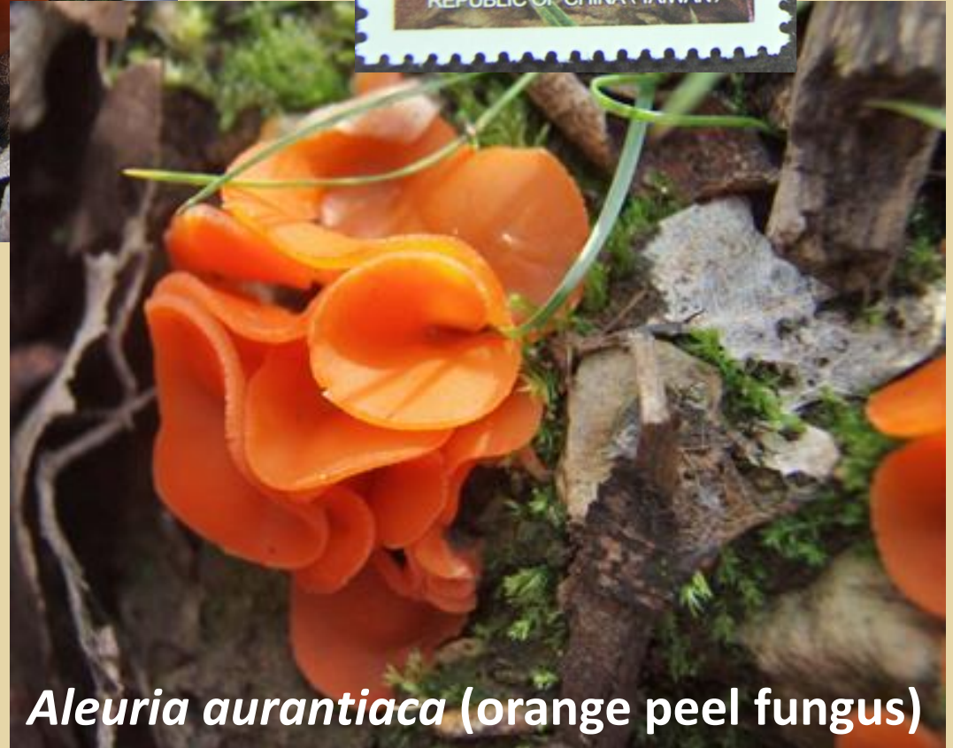
Aleuria aurantiaca (orange peel fungus)