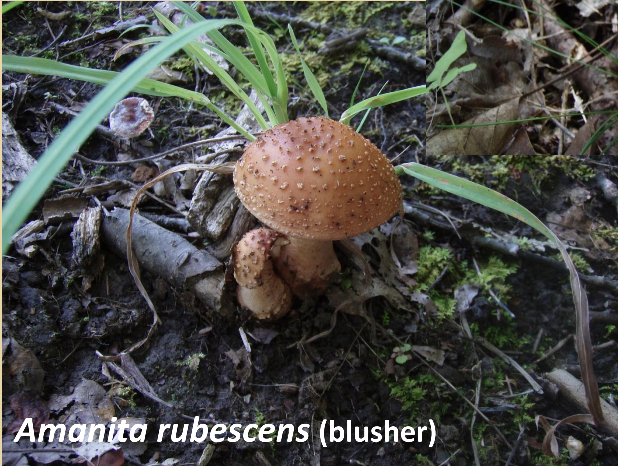
Amanita rubescens (blusher)