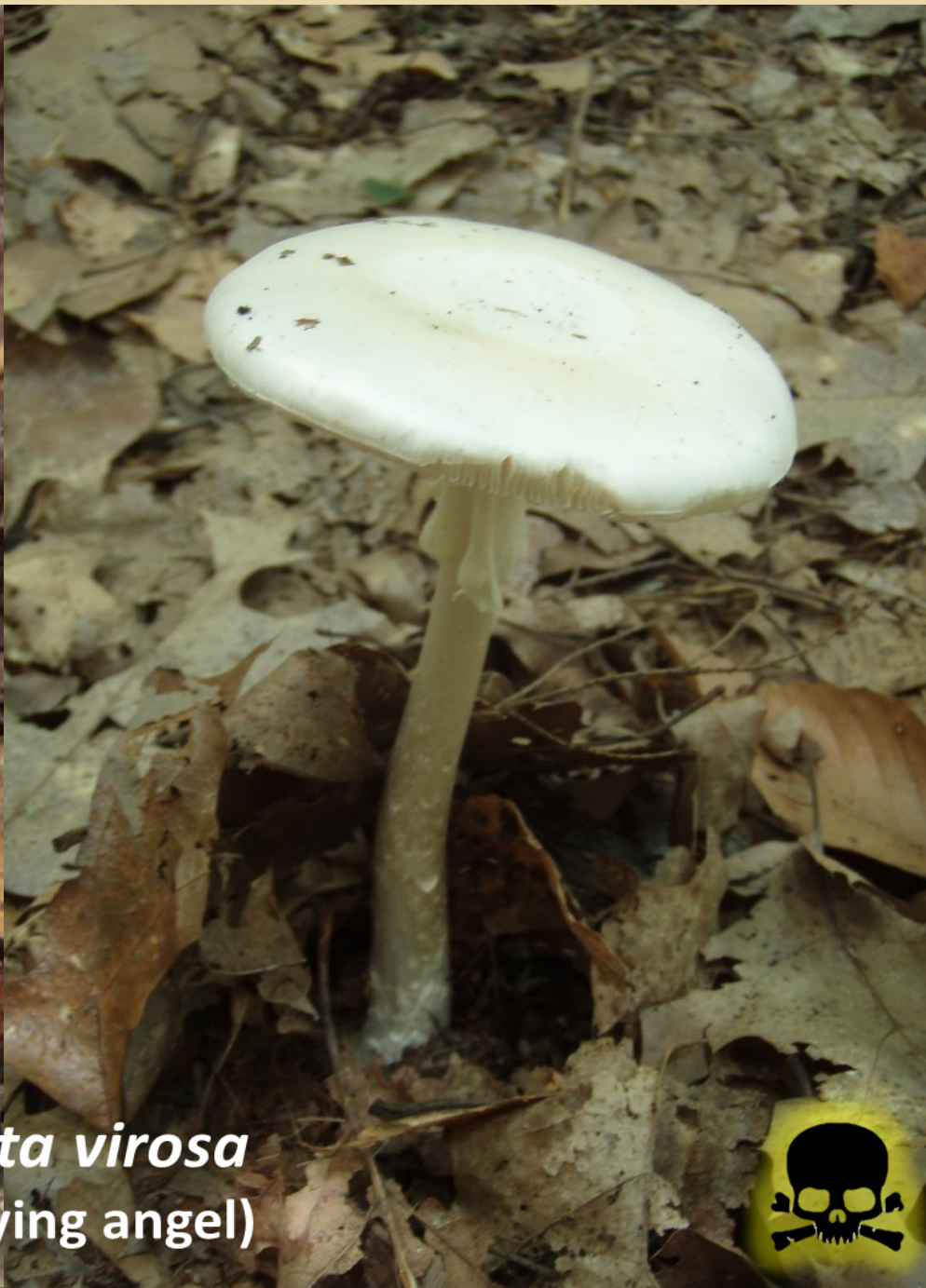
Amanita virosa (destroying angel)