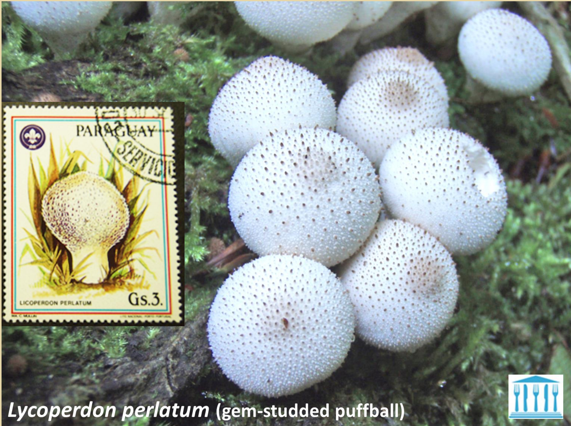
Lycoperdon perlatum (gem-studded puffball)