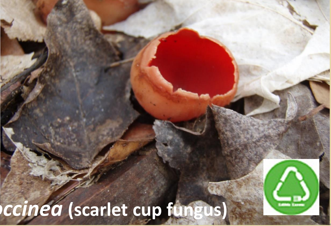
Sarcoscypha coccinea (scarlet cup fungus)