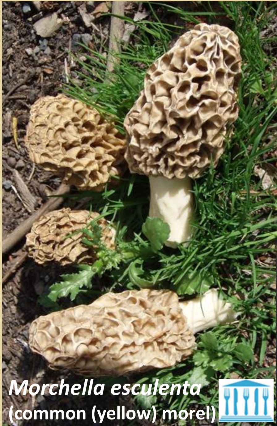
Morchella esculenta (common (yellow) morel)