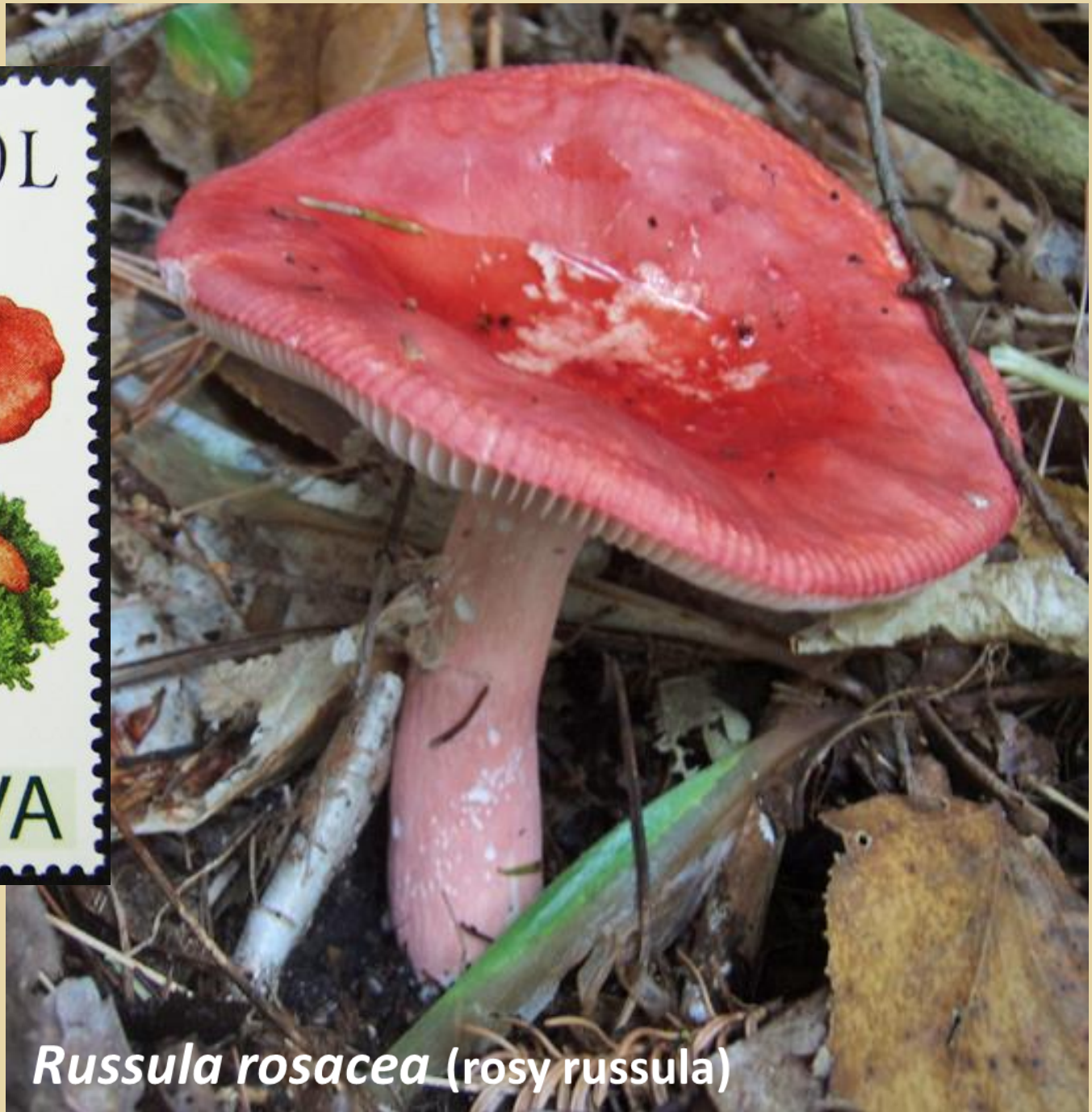
Russula rosacea (rosy russula)