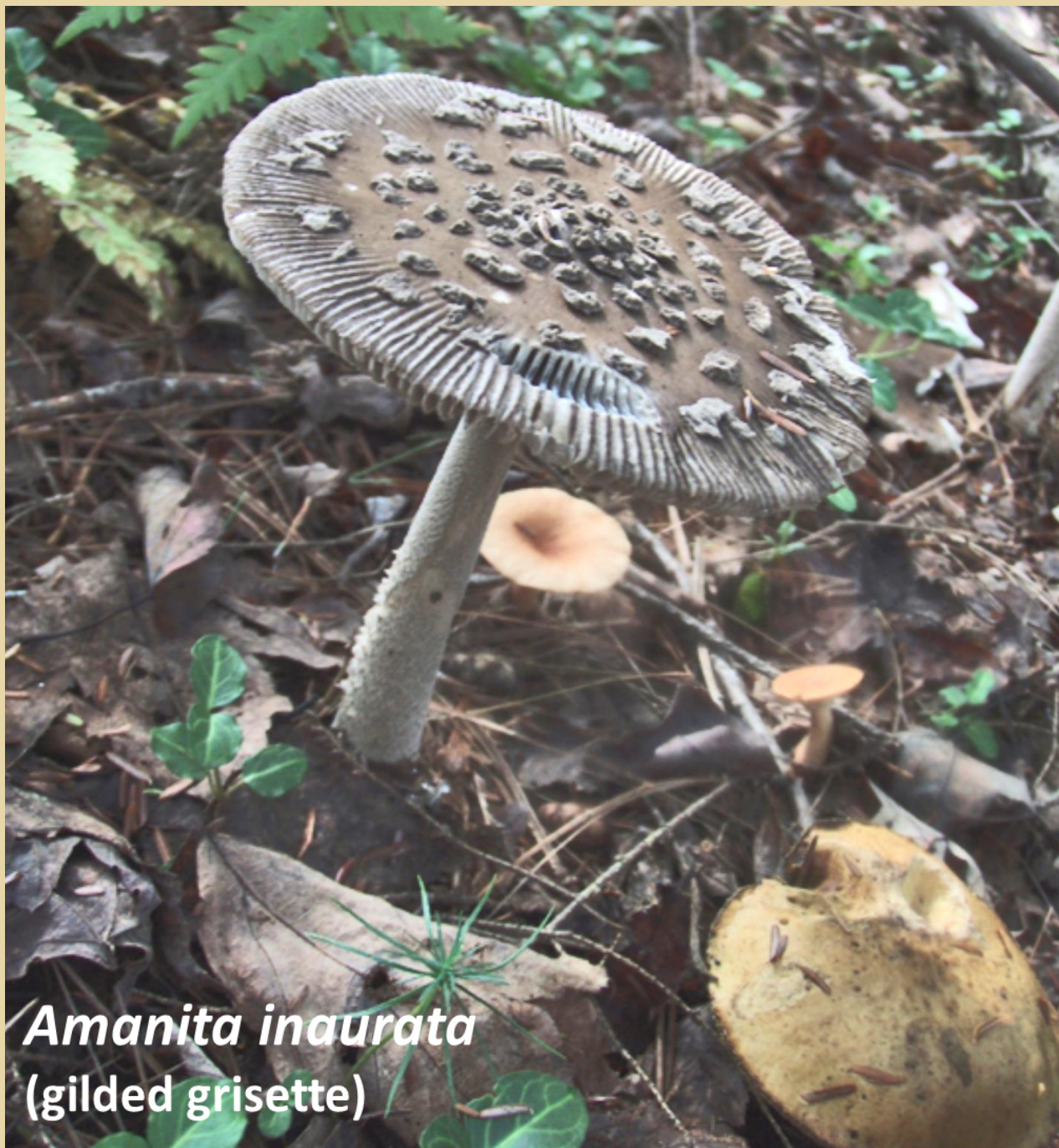
Amanita inaurata (gilded grisette)