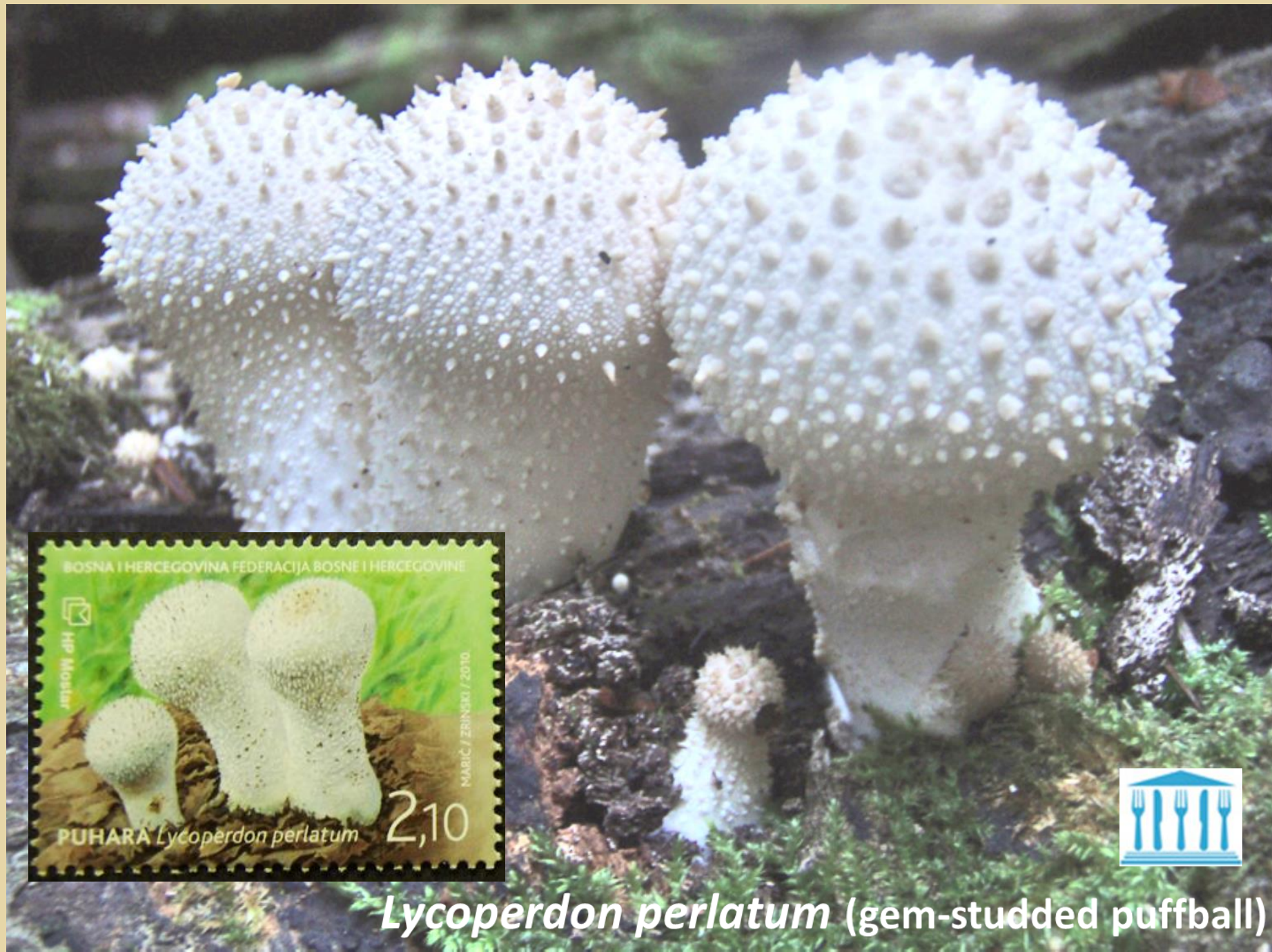
Lycoperdon perlatum (gem-studded puffball)