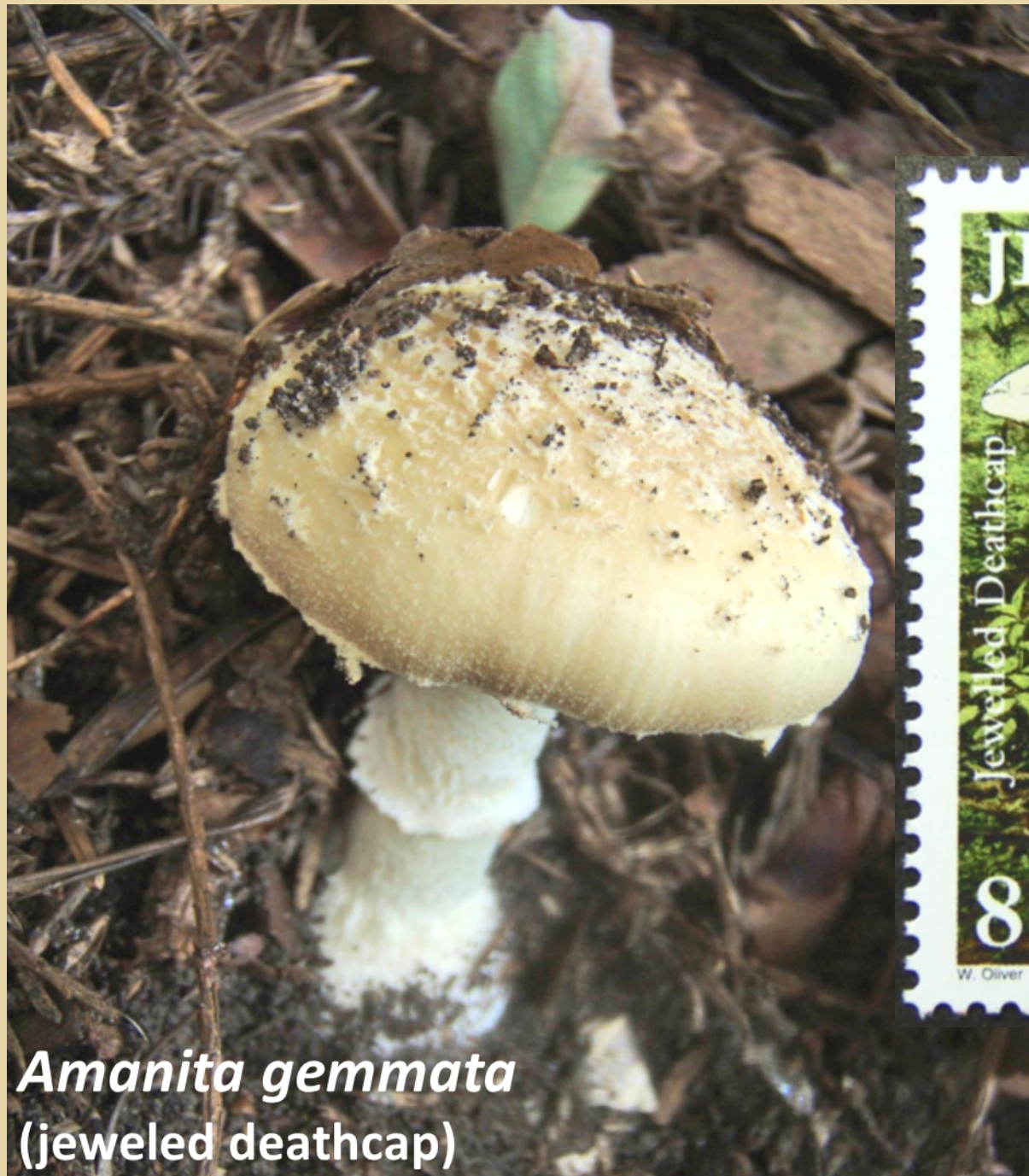
Amanita gemmata (jeweled deathcap)