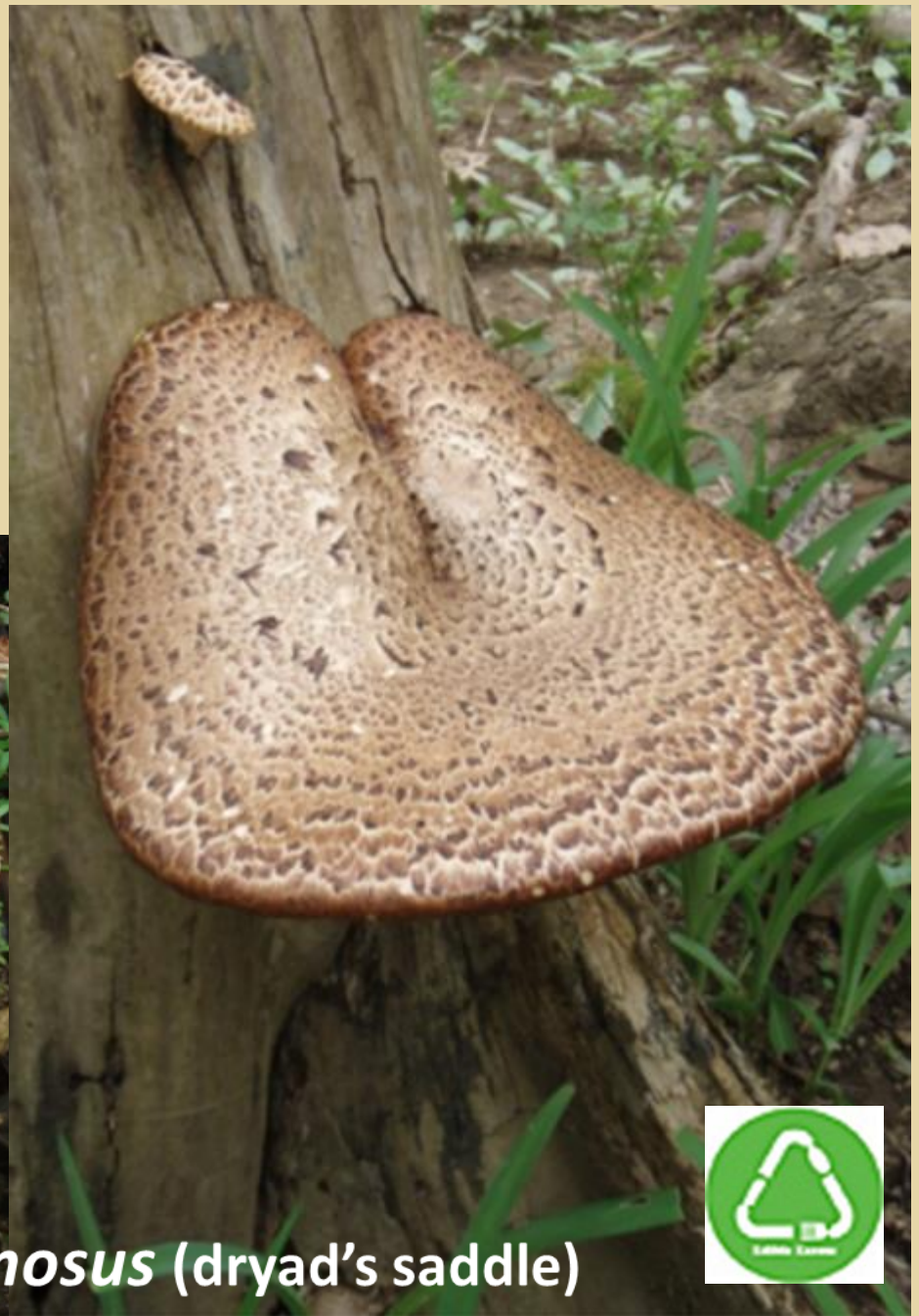
Polyporus squamosus (dryad's saddle)