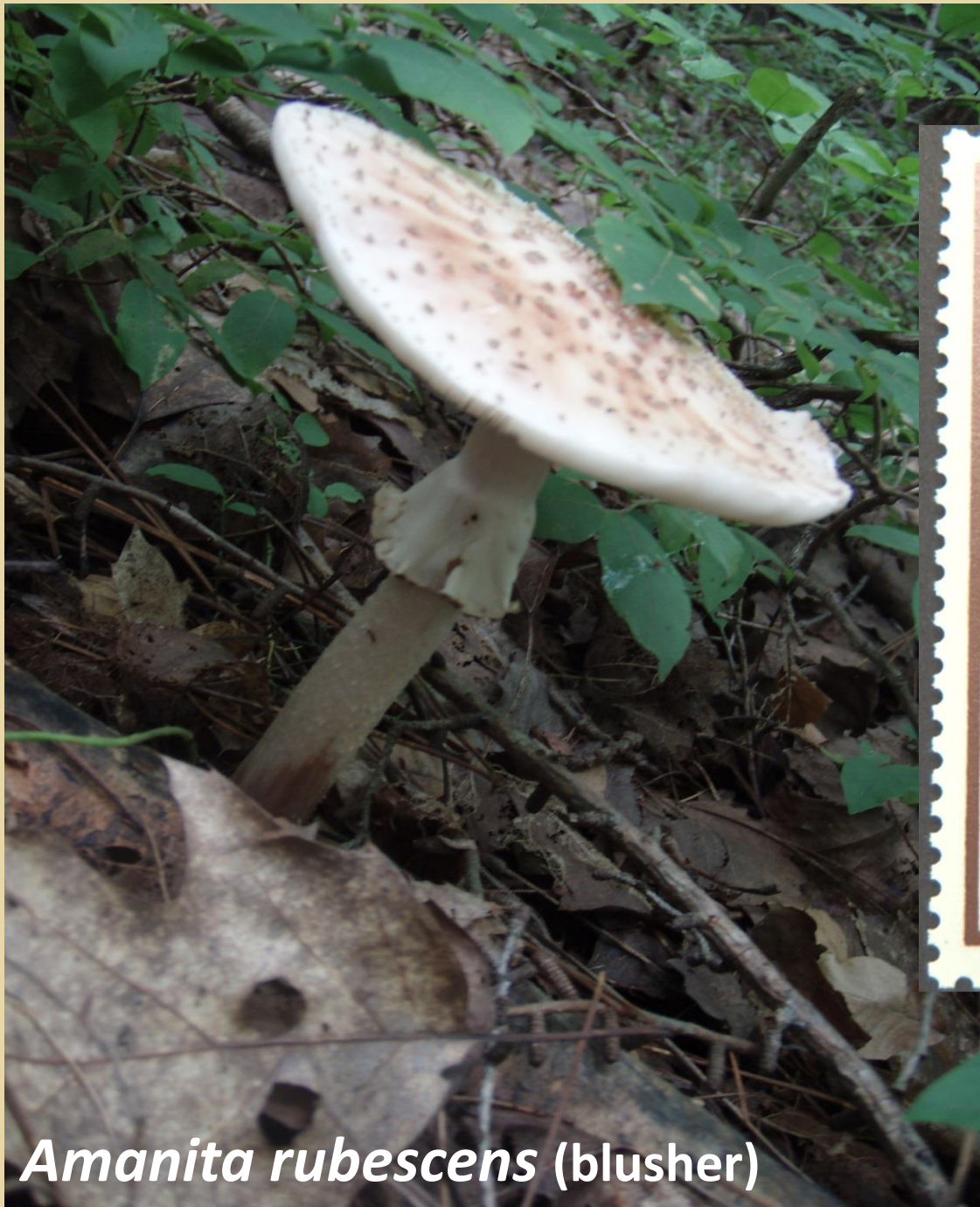
Amanita rubescens (blusher)