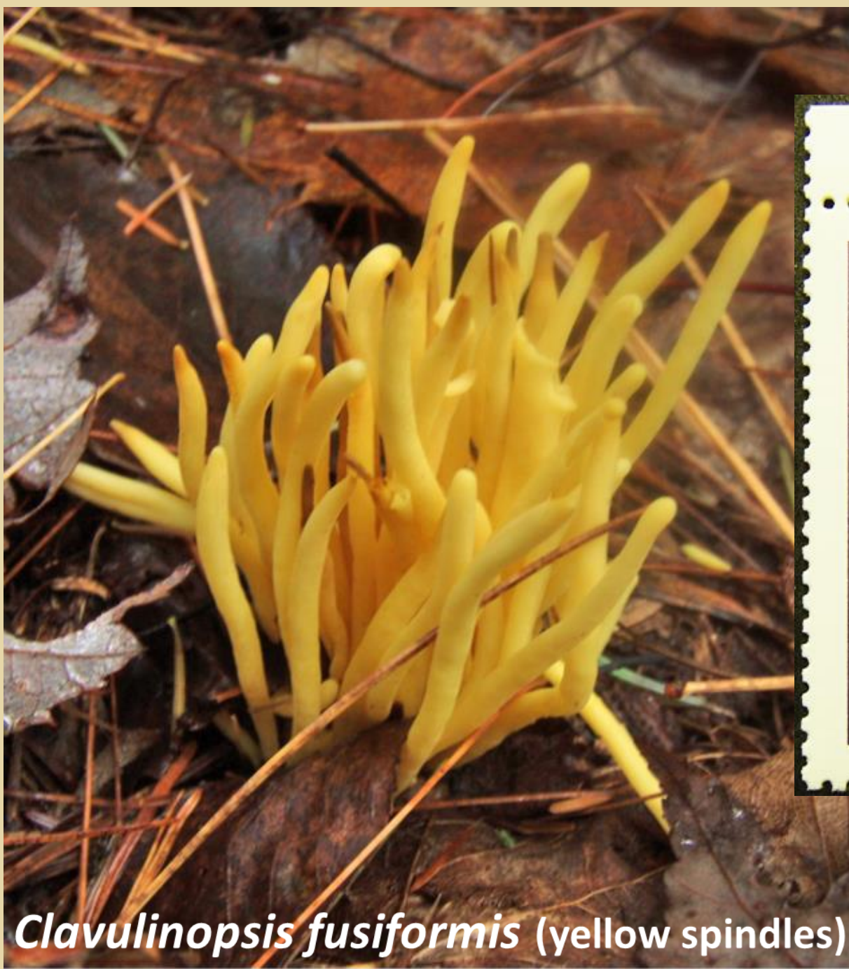
Clavulinopsis fusiformis (yellow spindles)