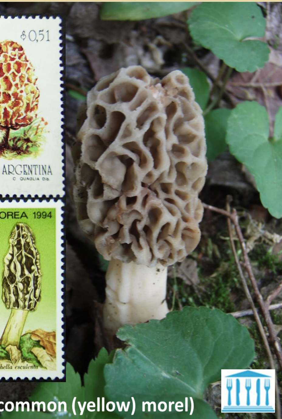
Morchella esculenta (common (yellow) morel)