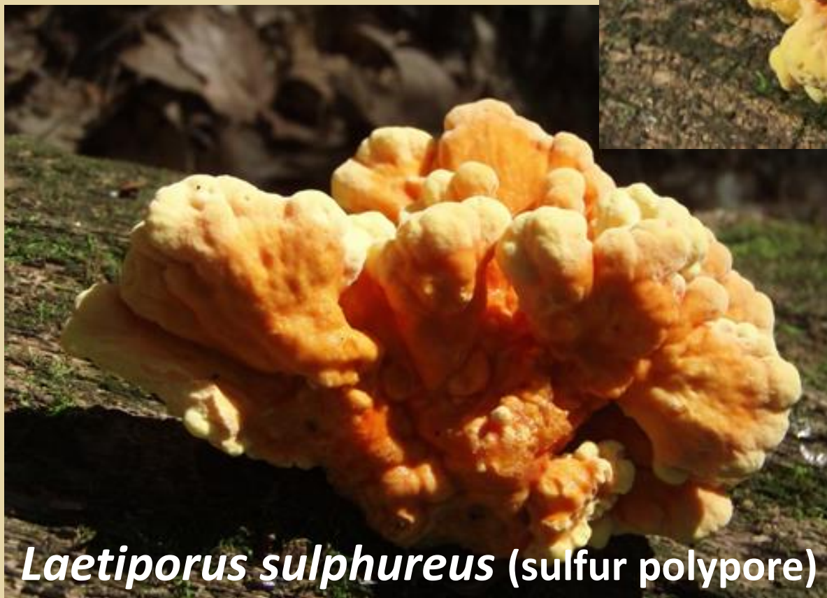
Laetiporus sulphureus (sulfur polypore)