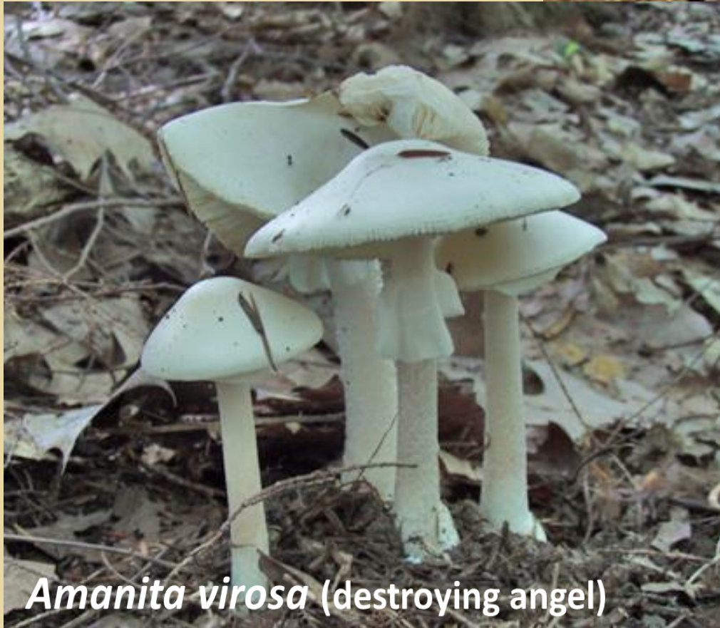
Amanita virosa (destroying angel)