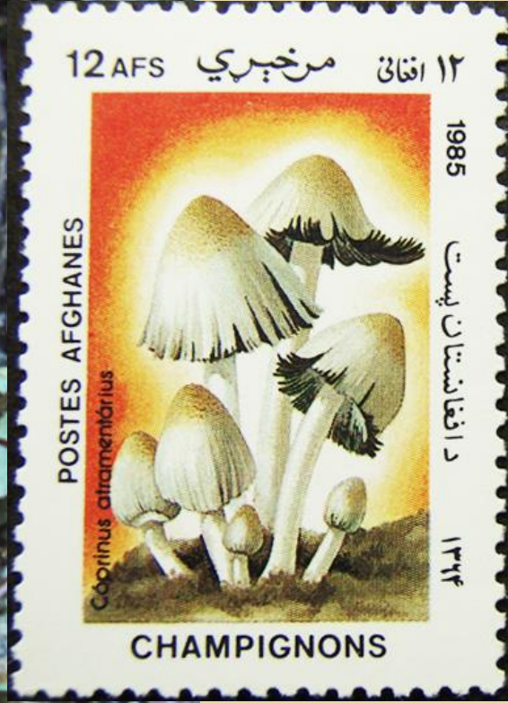
Coprinus atramentarius (alcohol inky)