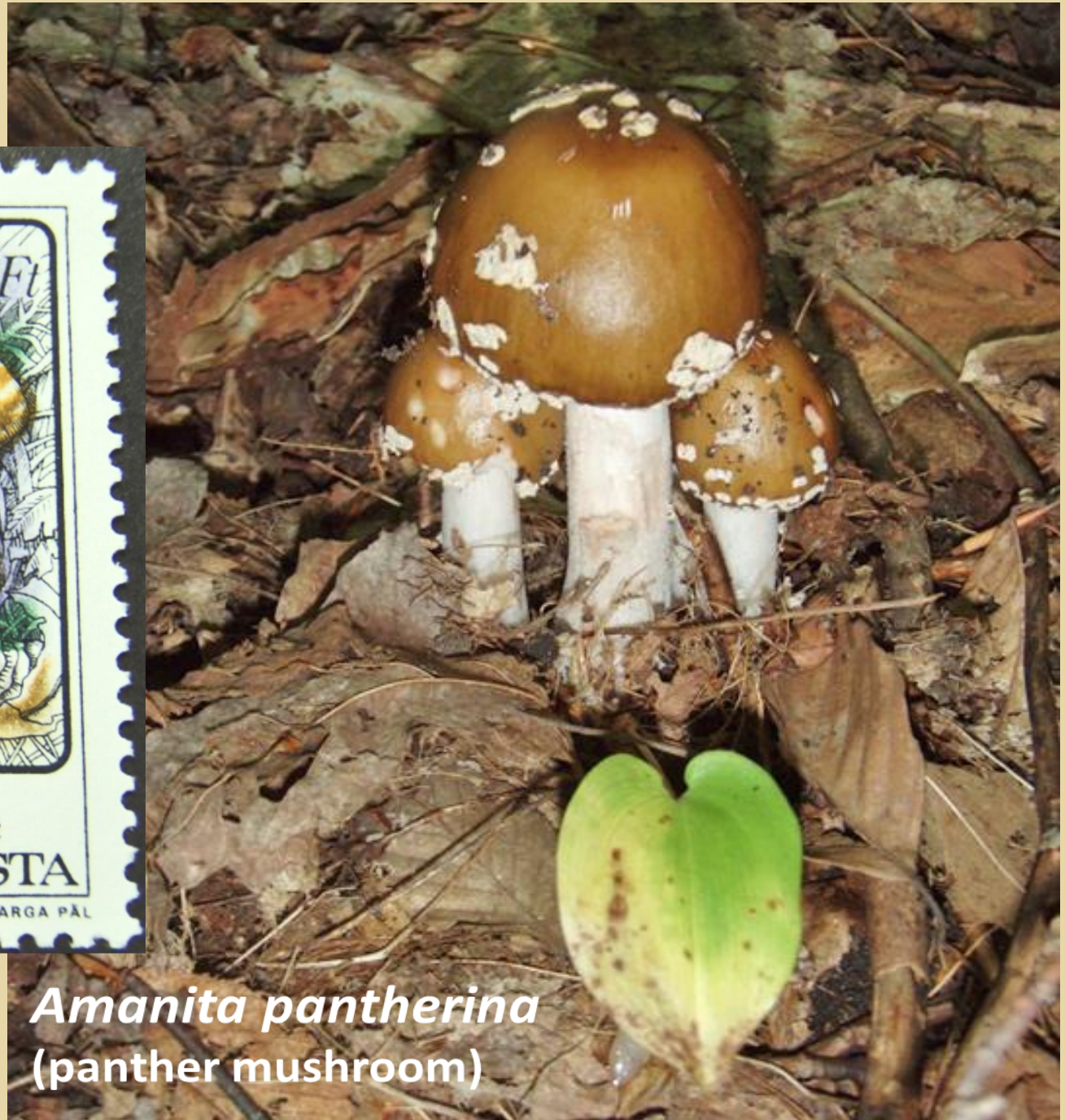
Amanita pantherina (panther mushroom)