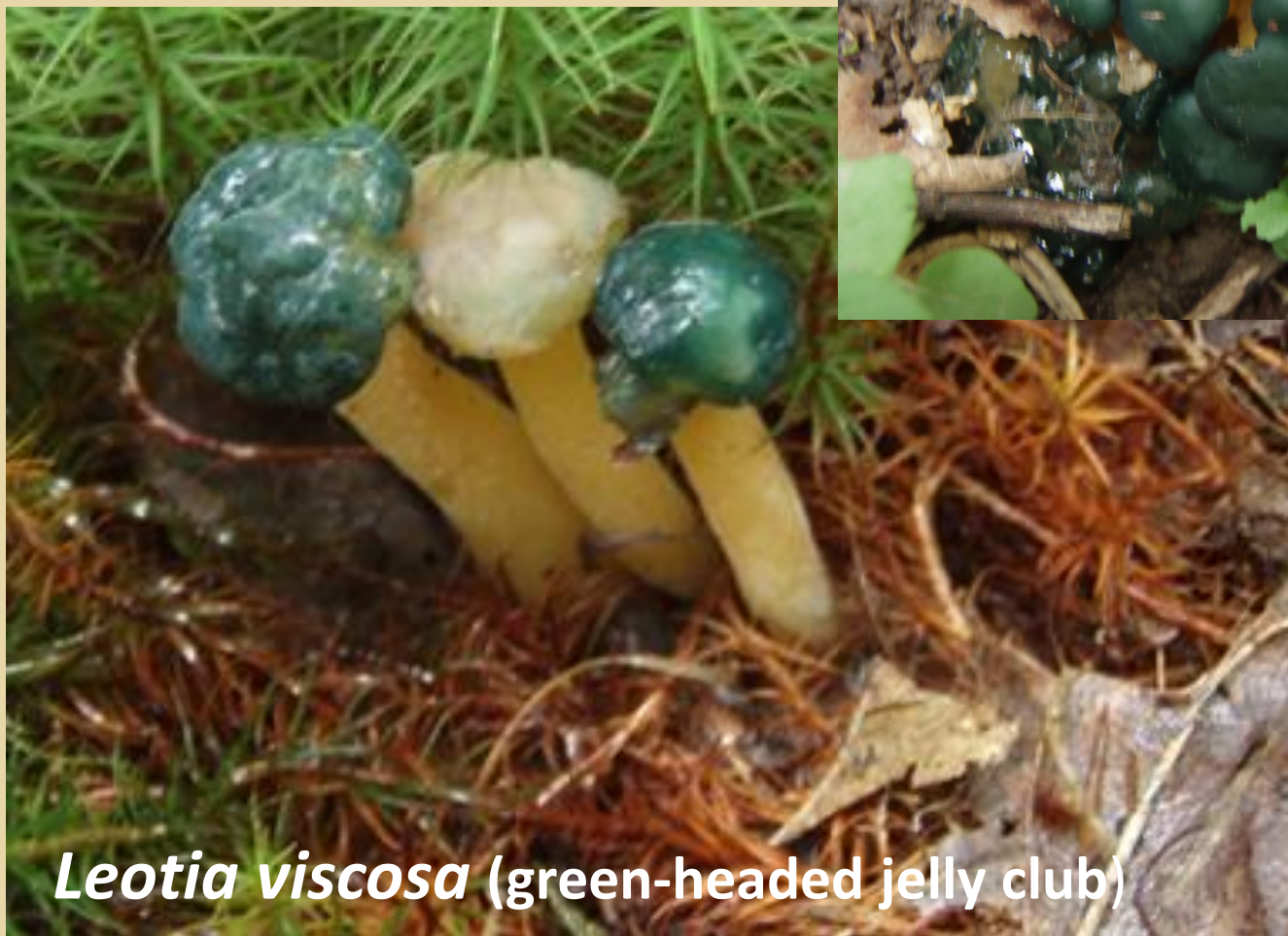
Leotia viscosa (green-headed jelly club)