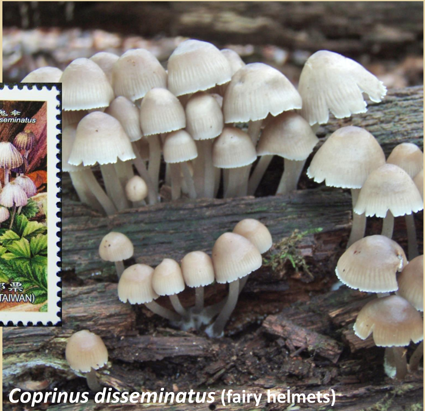
Coprinus disseminatus (fairy helmets)