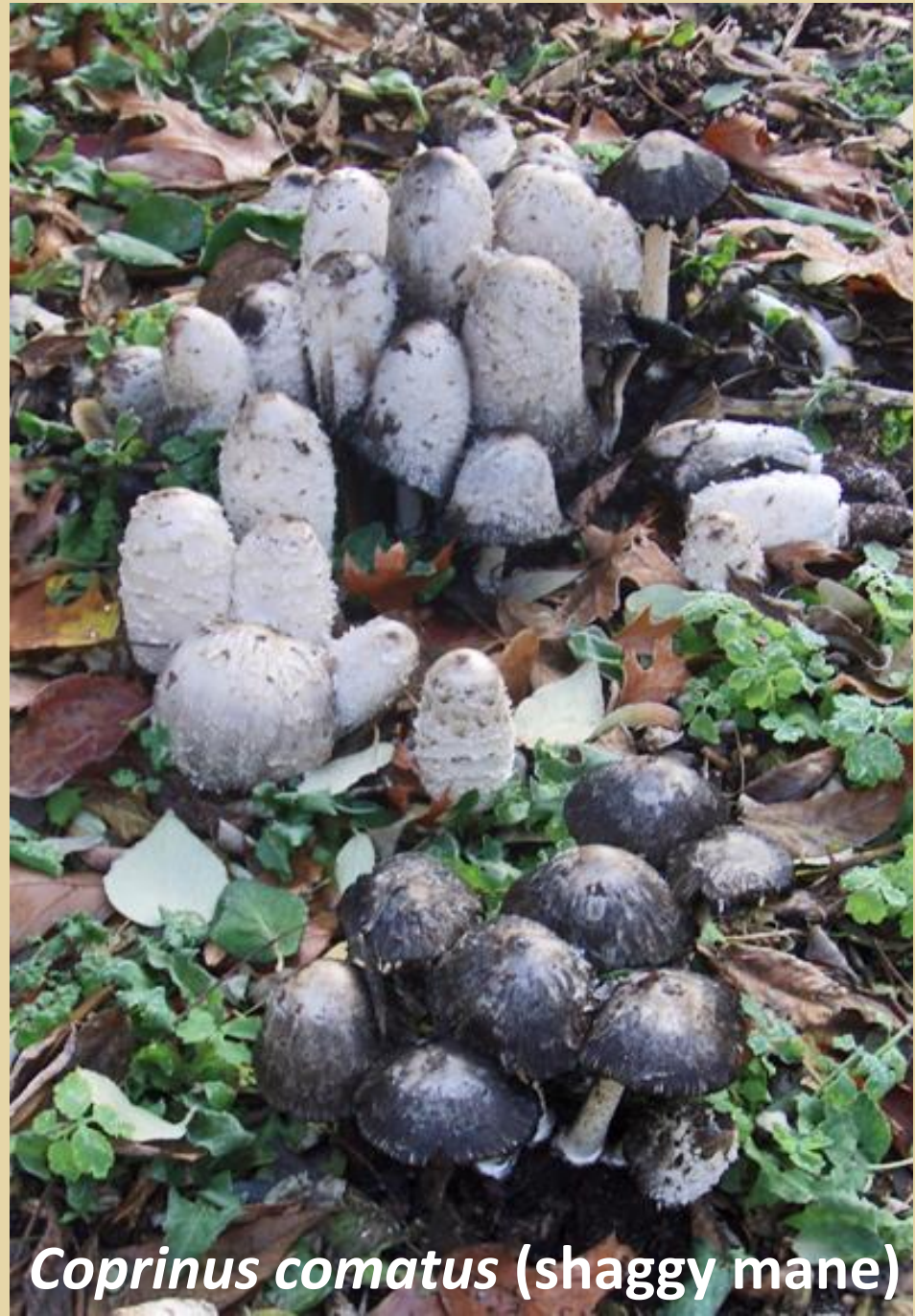
Coprinus comatus (shaggy mane)