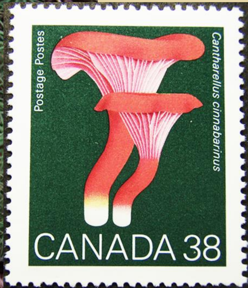
Cantharellus cinnabarinus (cinnabar-red chanterelle)