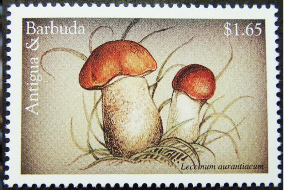
Leccinum aurantiacum (red-cap scaber stalk)