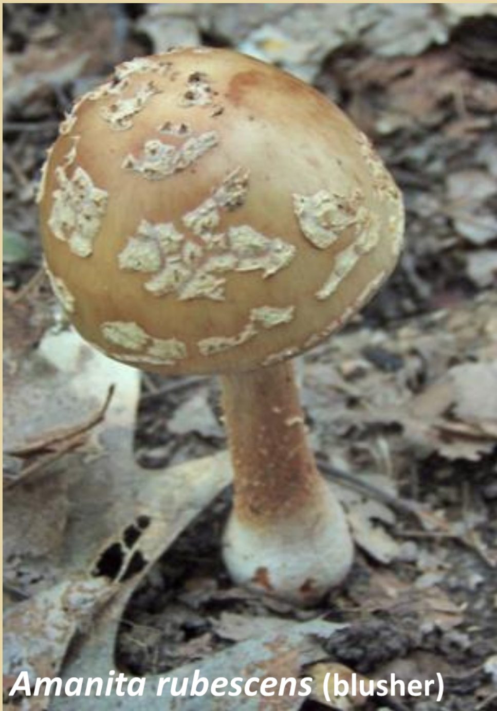
Amanita rubescens (blusher)