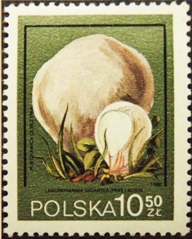
Langermannia gigantea (giant puffball)