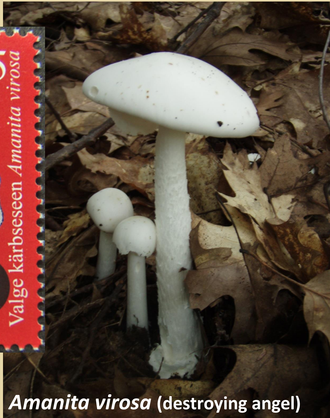
Amanita virosa (destroying angel)