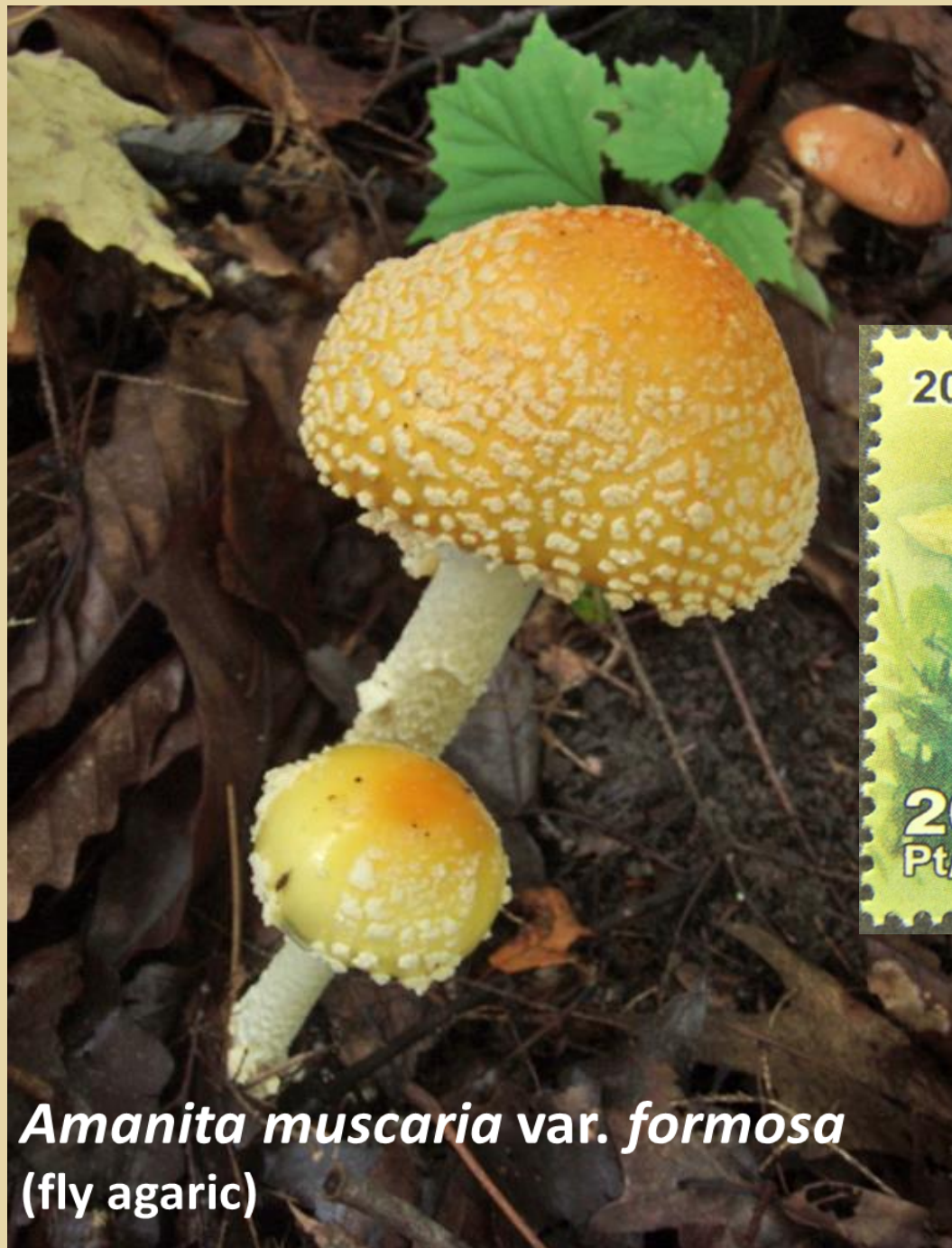
Amanita muscaria var. formosa (fly agaric)