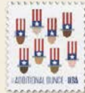
24. Uncle Sam's Hat