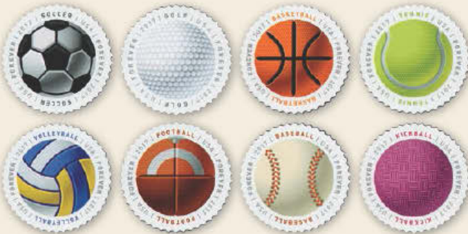
9. Sports Balls