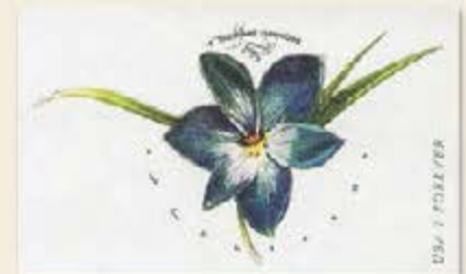
38. Azulillo Chilean Blue Crocus forever postal card and double reply postal card

The stamp poll ballot is on page 24. Stamps are not shown to scale.