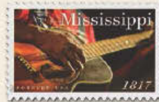
7. Mississippi Statehood