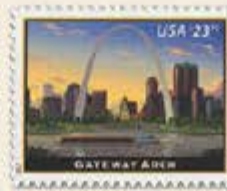
20. Gateway Arch