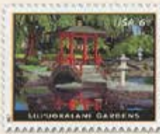
19. Liliuokalani Gardens