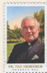
15. Father Ted Hesburgh