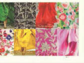
3. Oscar de la Renta