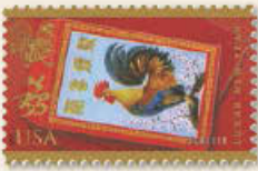
1. Year of the Rooster