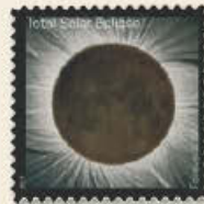
10. Total Solar Eclipse