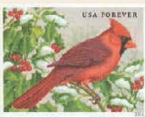
35. Northern Cardinal forever stamped envelope