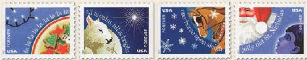
33. Christmas Carols