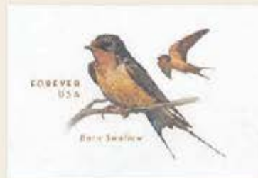
37. Barn Swallow forever stamped envelope