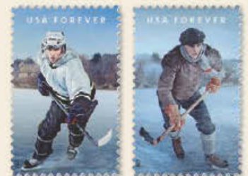
17. History of Hockey