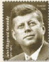
4. John F. Kennedy