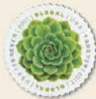
27. Green Succulent