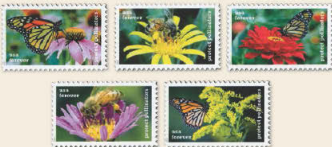
14. Protect Pollinators