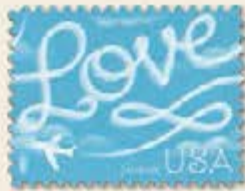
18. Love Skywriting