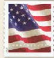
21. U.S. Flag