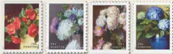
31. Flowers from the Garden