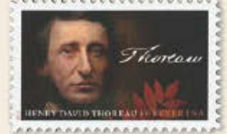
8. Henry David Thoreau