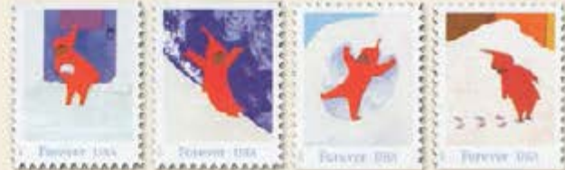
32. The Snowy Day