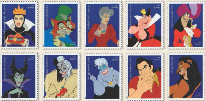
12. Disney Villains