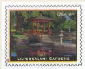
36. Liliuokalani Gardens Priority Mail stamped envelope