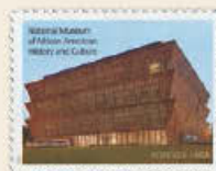
16. National Museum of African American History and Culture