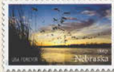
5. Nebraska Statehood