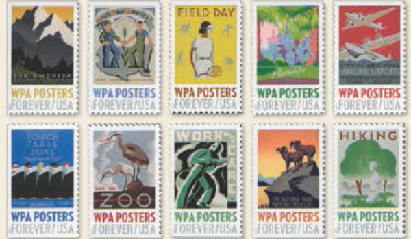
6. WPA Posters