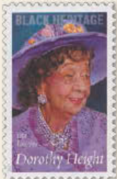
2. Dorothy Height