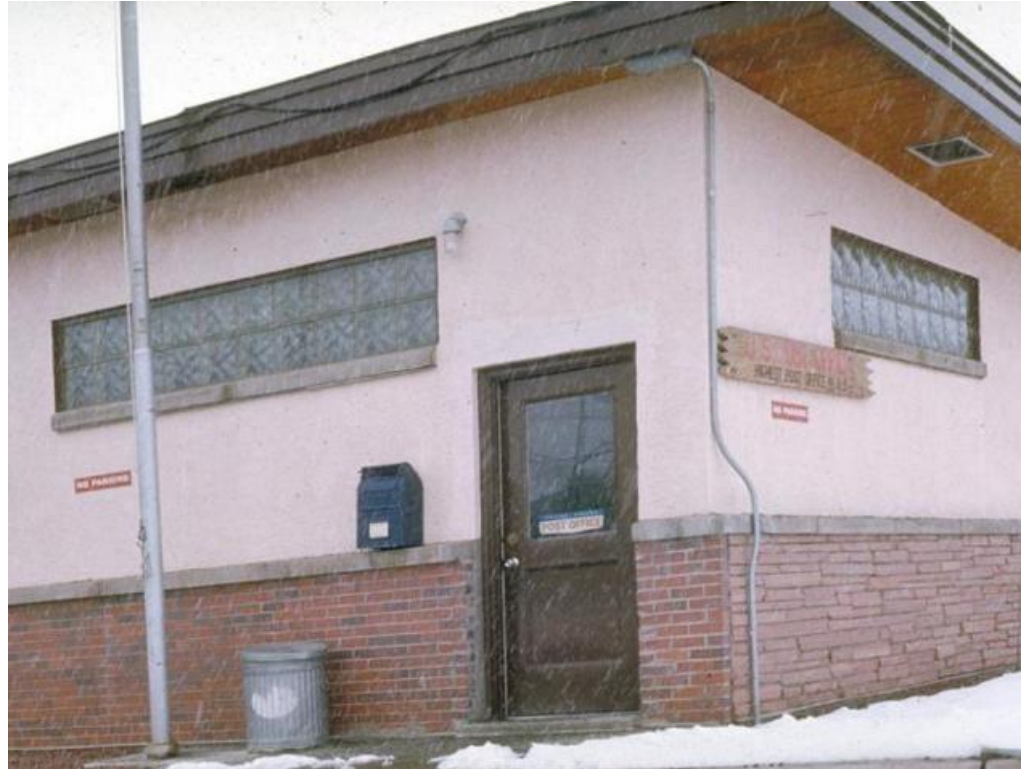
Climax, CO Post Office, Elevation 11,360' Closed in late 1980's

What is Climax, Colorado known for and why did the Post office close?