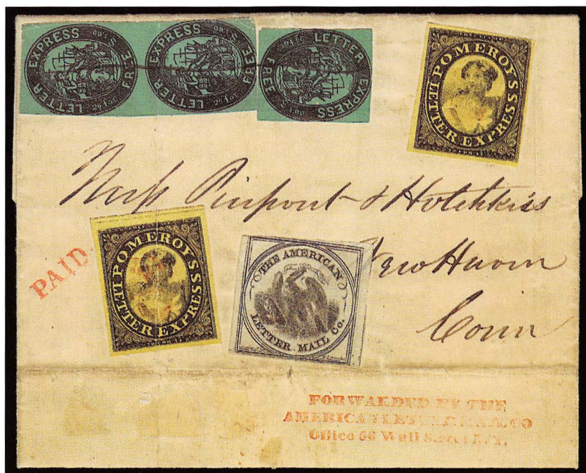
Figure 1. Probably the best-known of all Independent Mail covers, this is the only recorded cover with adhesive stamps of three different firms: in sequence, Wells' Letter Express (three 5c Black on Green), Pomeroy's Letter Express (two 5c Black on Yellow) and American Letter Mail Co. (one 5c Large Eagle).

Mixed frankings are categorized according to the stamps' relative functions and sequence of application. Years ago, Edwin Mueller devised a complex classification system for mixed frankings. He included everything from mixed-denomination and mixed-issue frankings to multi-country frankings. Collectors tend to place the greatest value on covers with stamps of two or more countries, which in combination pay the postage needed to convey the letter (without a forwarding or penalty charge).