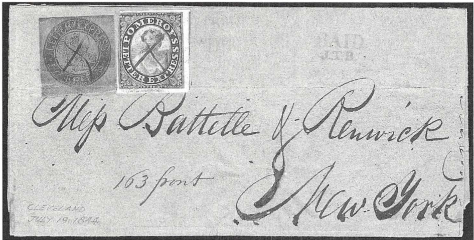
Figure 3. Wells' Letter Express 10c Black on Scarlet used with Pomeroy's Letter Express 5c Black on Yellow. Sent from Cleveland to New York City and delivered by Boyd's to 163 Front Street on July 19, 1844.

The triple-combination cover in Figure 1 is a Group II mixed franking, because the Pomeroy and American Letter Mail Co. stamps were used to credit portions of the original postage paid. The sender's prepayment (three Wells' Letter Express stamps) represents the total postage rate. The two Pomeroy stamps (affixed by the Wells office) and one American Letter Mail Co. stamp (affixed by the Pomeroy office) represent credits from one firm to the other. The role of the second and third frankings is analogous to the Hawaiian Missionary and U.S. mixed-franking cover used as an example of a Group II mixed franking.