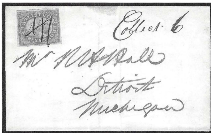
Figure 6. August 14, 1844, New York City to Buffalo (by Pomeroy) and Buffalo to Detroit (by Wells). Pomeroy's Letter Express 5c Lake prepays postage for the first leg of the trip. The "Collect 6" is Wells' share due from addressee.