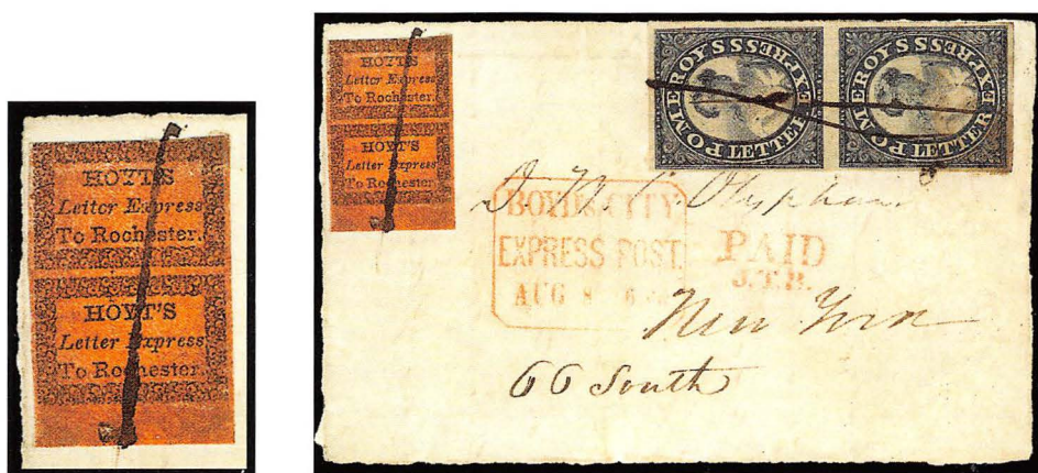
Figure 7. Hoyt's Letter Express pair (top stamp has "Letter" error) in combination with pair of Pomeroy's Letter Express 5c Blue, applied at Rochester N.Y. on a cover front to New York City, delivered by Boyd's on August 8, 1844.

The double-rate mixed franking in Figure 7 proves that Hoyt's adhesive was a stamp of value rather than an advertising label, despite the absence of a denomination. There would be no point in affixing two ad labels (with a corresponding double Pomeroy franking). Hoyt's stamps must have represented prepayment. If Hoyt collected 10c from the sender, as evidenced by his stamps, then what purpose did the Pomeroy stamps serve? Do they represent an additional 10c postage? If not, what was their function and how was Hoyt compensated for them? This question is also posed by the other three Hoyt/Pomeroy mixed-franking covers, all of which are single rates.