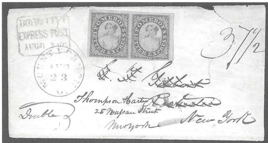
Figure 8. Sent by U.S. mail from Mt. Vernon, O., to Rochester, then forwarded to N.Y.C. by Pomeroy. U.S. rate was 37½c. Pomeroy 5c Blue pair pays 10c rate.

One possible explanation is that Hoyt's stamps were initially sold by his offices along the canal to allow patrons to prepay Pomeroy's rates, but they were not accepted by Pomeroy's main office. When a letter was received at Hoyt's Rochester office with one of his Hoyt's Letter Express stamps, a corresponding Pomeroy stamp was affixed to ensure acceptance as a prepaid letter. As a Pomeroy agent, Hoyt received a free supply of Pomeroy stamps, thus it would be possible for him to apply them without incurring additional cost. If this theory is correct, then the mixed frankings on Hoyt/Pomeroy covers represent an unusual circumstance in which the secondary franking essentially validates the primary franking.