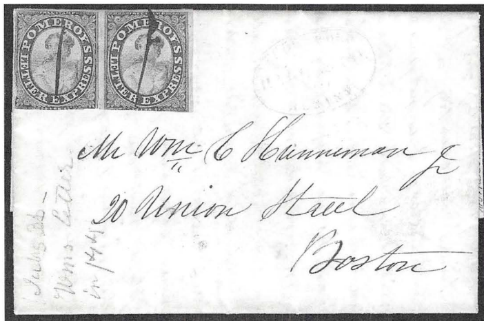
Figure 5. July 31, 1844, from Rochester N.Y. to Albany (by Pomeroy) and Albany to Boston (by Hale). The pair of Pomeroy's Letter Express 5c Blue pays 10c postage, which was divided between the two firms.

Some conjunctive-use frankings are not mixed—that is, they do not involve stamps of two different firms—yet they represent prepayment that was to be divided between the cooperating Independents. Figure 5 is such a franking. The pair of