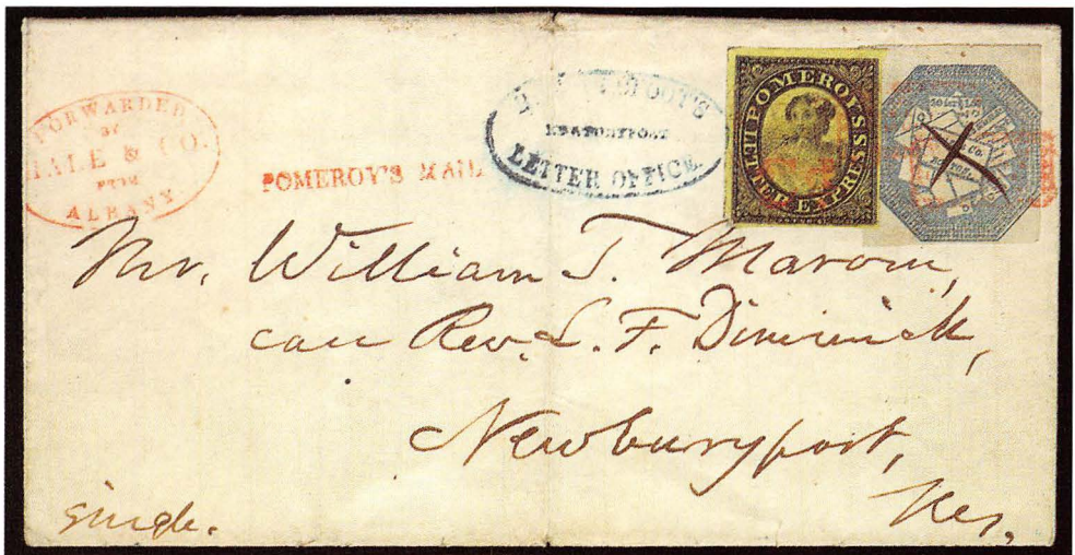
Figure 4. A rare Group I mixed franking with Independent Mail stamps. The Hale & Co. and Pomeroy's Letter Express stamps were affixed at the same time by the sender. Each stamp pays an equal part of the postage.

Pomeroy cancelled its stamp with the red "Cd" and applied the "Pomeroy's Mail" straightline. Hale & Co.'s Albany office applied its red oval handstamp at upper left and cancelled the Hale stamp with the red rectangular handstamp. Crofoot applied its blue oval handstamp.