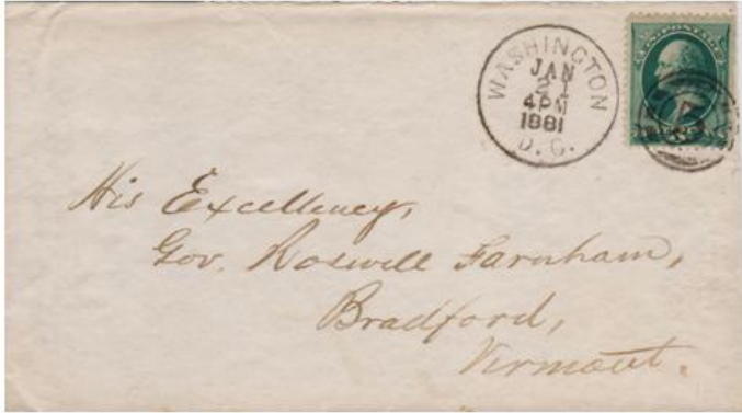
The attractive Washington DC cancellations and the addressee, Roswell Farnham, who was the 38th Governor of the state of Vermont, attracted me to this cover.

Roswell Farnham was born in Boston, MA. on July 23, 1827. He graduated from the University of Vermont in 1852. He entered the Civil War as a second lieutenant with the 1 st Regiment Vermont Volunteers. After the war Farnham practiced law until being elected governor in 1880, He served only one two year term focusing his legislative efforts on education and prison reform. Farnham died on January 5, 1903 at the age of 75 and is interred at Bradford Town Cemetery, Bradford, Vermont.