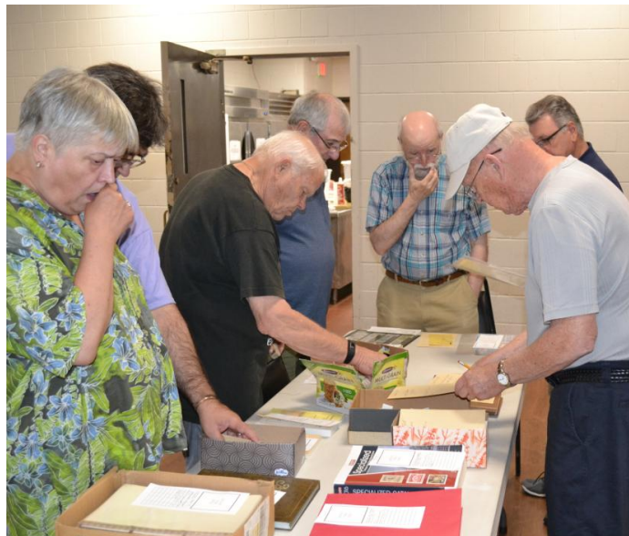
Just another silent auction at a Rochester Philatelic Association meeting attracting a crowd of stamp collectors: like they say at Ollie's "Good Stuff Cheap".

Visit our online calendar for even more information on area stamp shows.