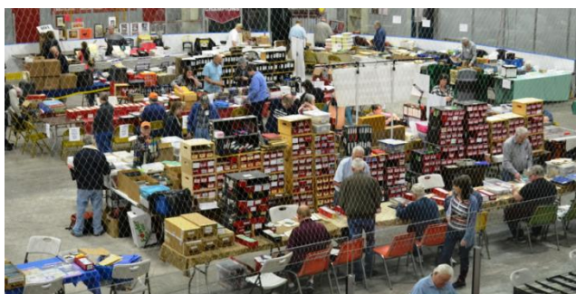
Half of the ROPEX show floor.