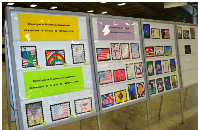
RPA proudly displayed all 35 Design-A-Stamp entries in the exhibit area at ROPEX.