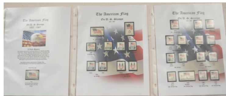
"The American Flag"