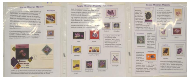
"Purple Minerals Majesty"