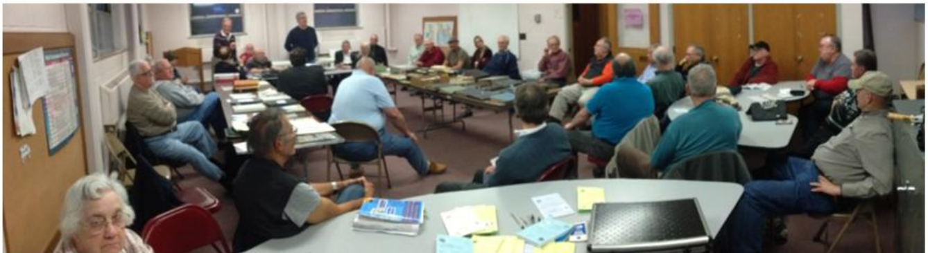
And for the back page, how about a panoramic view of Auction night (April 9 th ) from the back of the room!