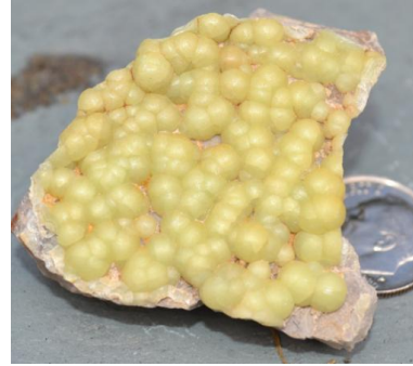
Wavellite (stamp and mineral)