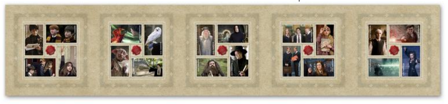
Did you get your Harry Potter stamps? Twenty different Forever stamps issued on November 19, 2013

March 1-2 VFW Post 2450 Walden Ave Cheektowaga, NY