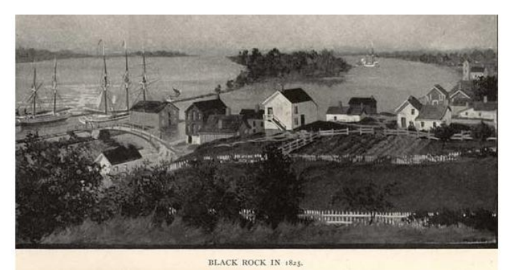
The quiet village of Black Rock, NY in 1825