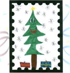
Kendall Caton 3rd Place- Grade 4-6 Age 9, Grade 4 East Rochester Elementary