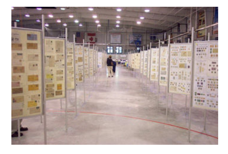
Nice wide aisles between exhibit rows