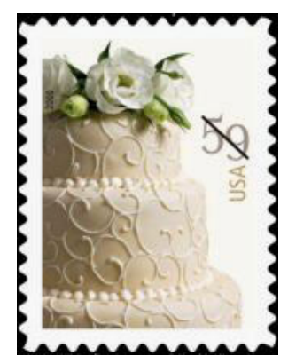
unknown release dates

Another rate increase is planned for May, possibly to 44 cents. Denominations shown may change.