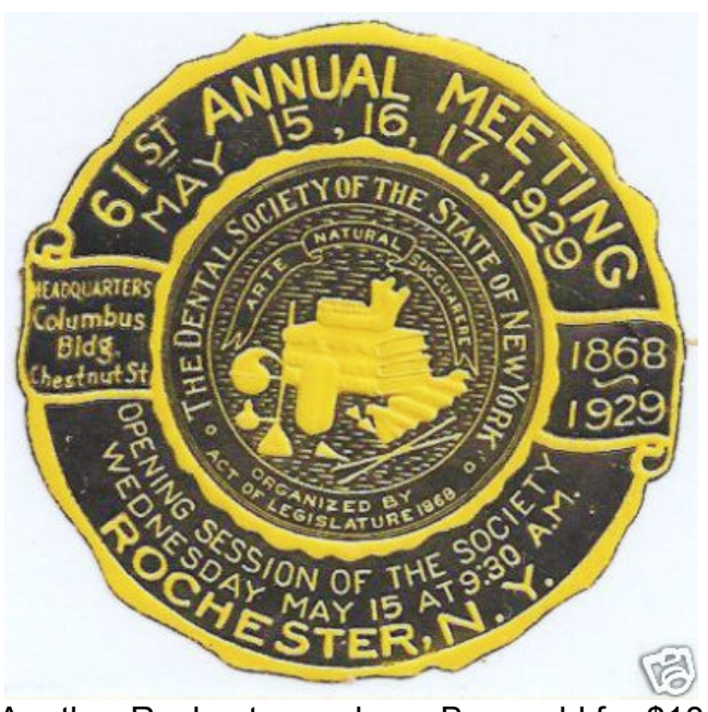
Another Rochester seal on eBay- sold for $18