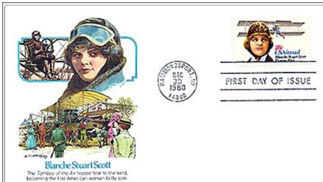
A First Day Cover of Scott # C-99