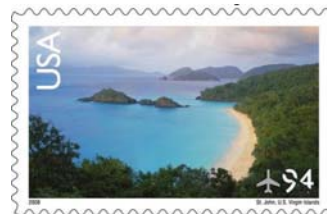
Stamps to be Issued at ROPEX