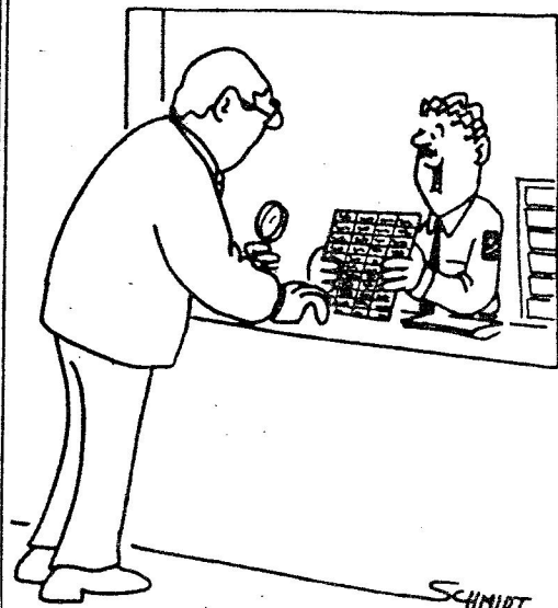
"... and here's a set honoring the continual increase in postal rates ..." NATIONAL ENQUIRER