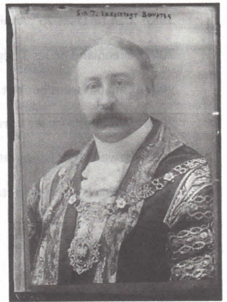
Sir Vansittart Bowater, predictor of the future