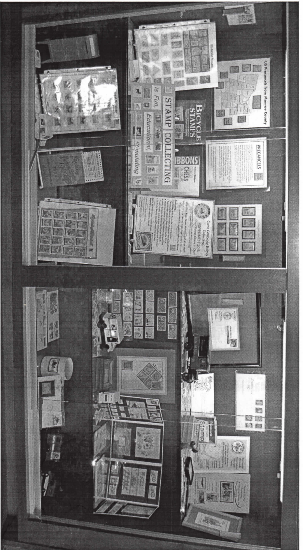
Brighton Library Display – RPA, May, 2013